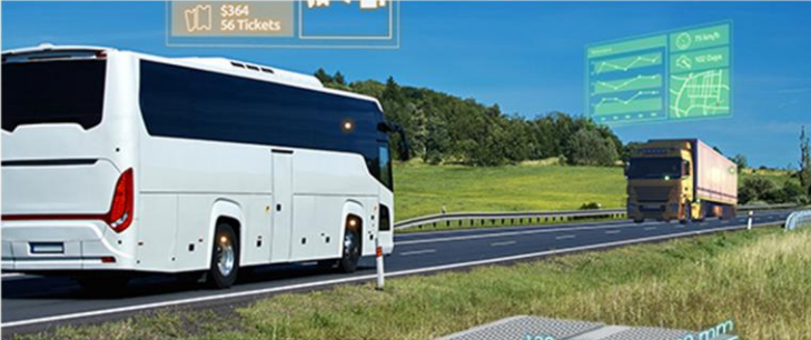
VTC 1910 Palm-Sized Ruggedized Telematics Gateway Powered by Intel Atom® Processor E3815