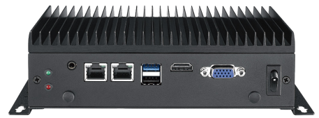
Rear Panel External I/O